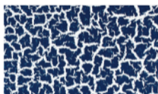
EC5010 Gentian Blue RAL5010 TNR: 416440