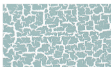
EC7000 Squirrel Grey RAL7000 TNR: 418464