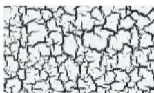
EC9010 Pure White RAL9010 TNR: 418488