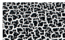
EC9017 Traffic Black RAL9017 TNR: 418495